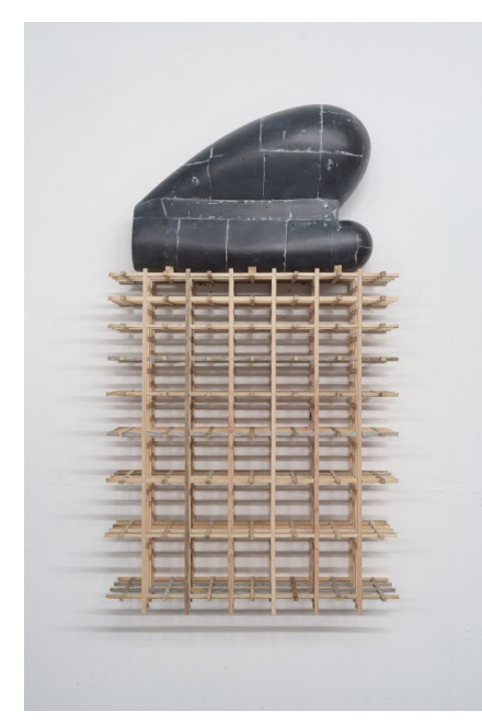
Hiroyuki Hamada, #94 , 2021, Pigmented resin and wood, 41 x 23 x 8 inches. (BP#HH-8718)

"There is no inherent rule against expressing an existential condition of humanity and nature as long as the captured dynamics somehow echo its essence. It can be manifested as a poem, but it can also be manifested as a revolution and all things in between. It's about embracing life and celebrating it."