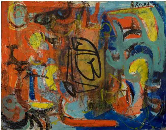
Paul Resika, Virgin , 1945, Oil on canvas, 28 x 36 inches. (BP#PR-9525)

Bookstein Projects is pleased to announce an exhibition of paintings by Paul Resika. This is the artist's fifteenth solo show with the gallery.